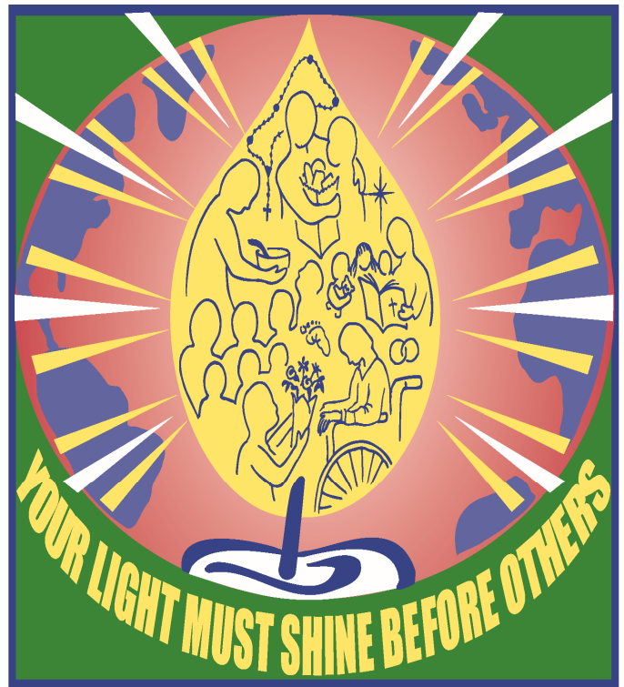
© 2007 J. S. Paluch Company, Inc.